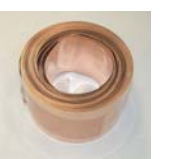
3-Inch-Wide Copper Strap PN 5621-0032-3