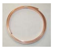
1/2-Inch-Wide Copper Strap PN 5621-0032-0