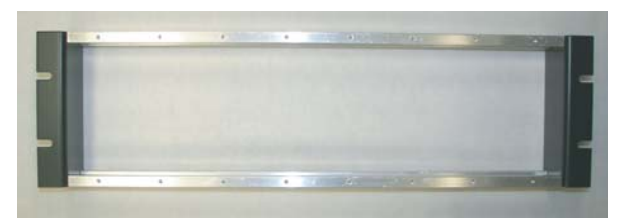
19" Rack Mounting Frame PN 0411-6183-2