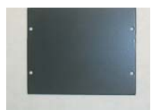
Blank Panel for Rack Mounting Frame PN 0411-6273-2