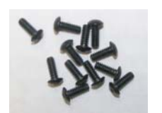
6-32 Screws for Rack Mounting Frame PN 1324-1254-3