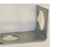
Bracket for Connecting HV Conduit to Source Tray PN 0040-9982-0