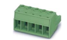
Terminal Block for User-Supplied Input Power Cable PN 6149-1967-485